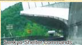
Senkyo Shelter commands