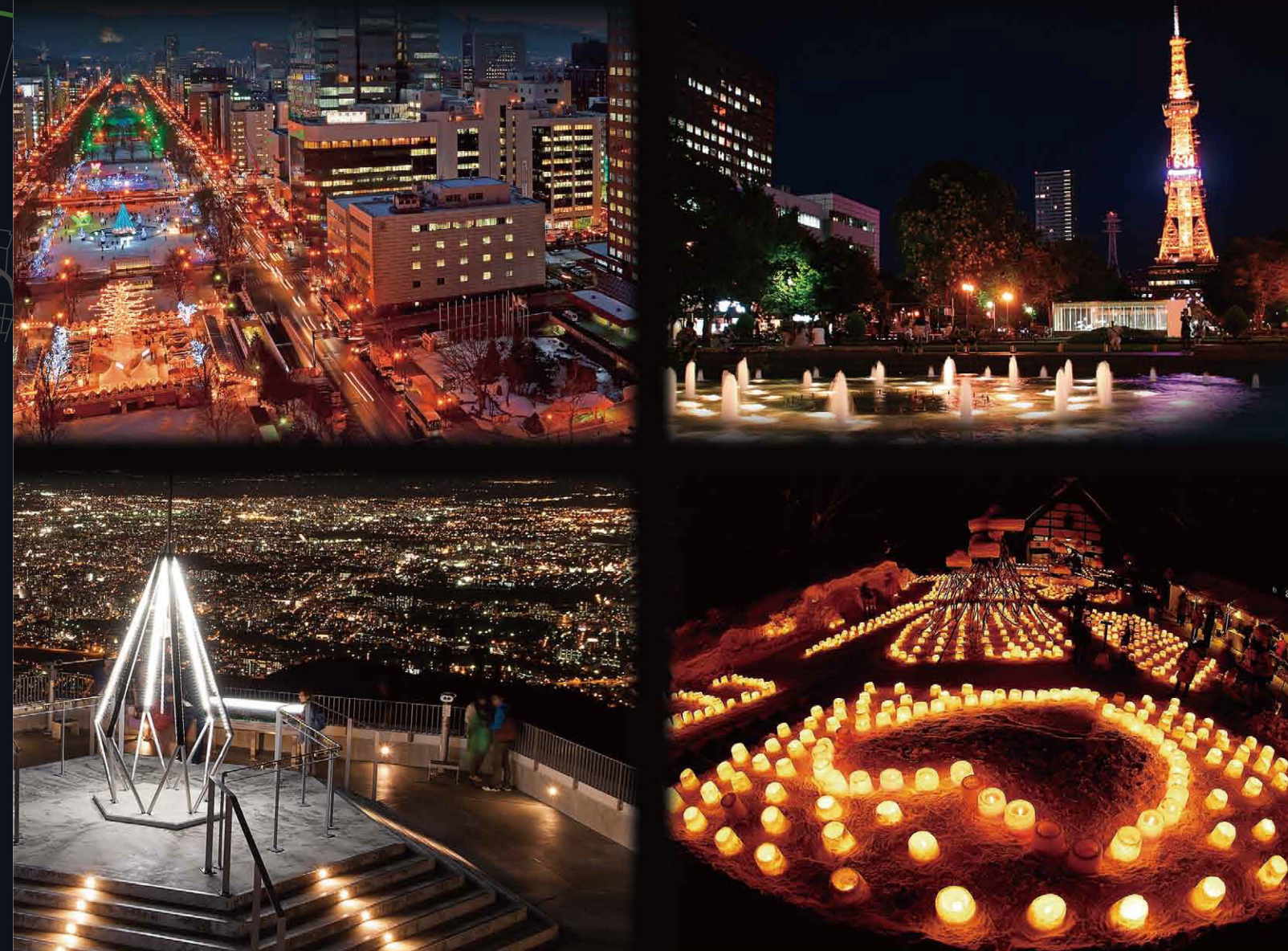
【Sapporo Time of Sunset】